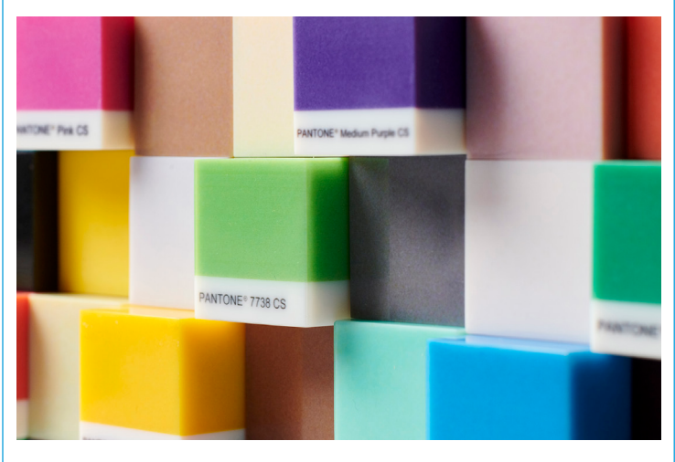
Pantone color blocks