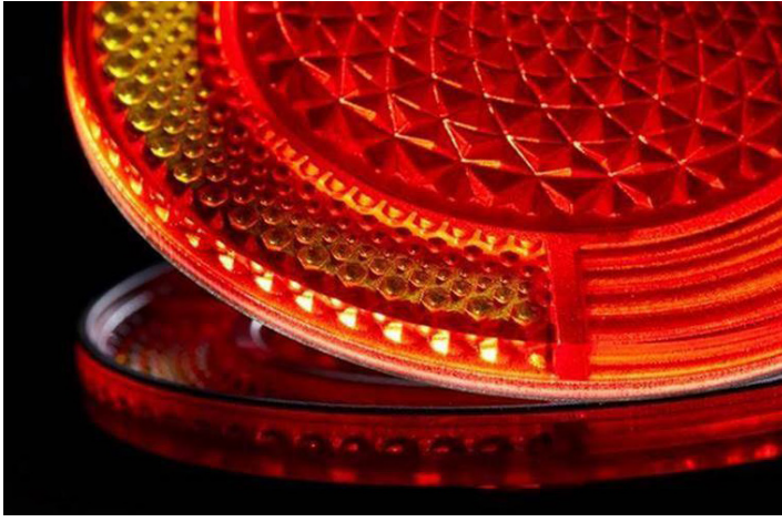
*PANTONE Validation™ available on J826 Prime and J850 Prime